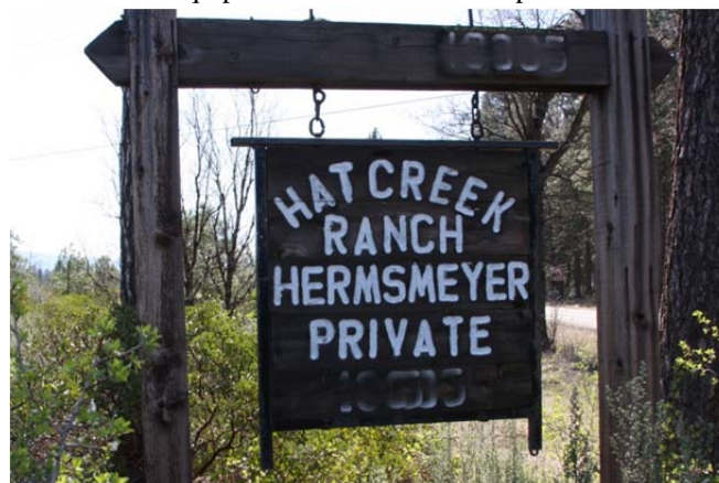
Private, deeded entrance from Hwy 89