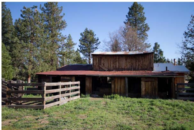
Horse stables with ±5 acres of fenced pasture