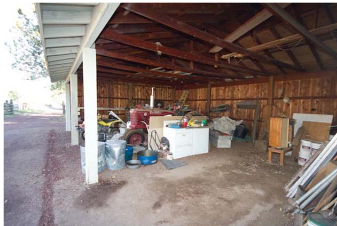
Farm equipment shed and workshop