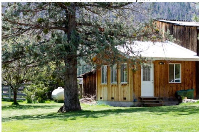
* Pottery studio (not permitted)