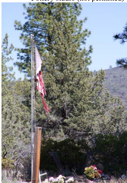
Historic, sacred burial ground – isolated from ranch operation – separate entrance/access